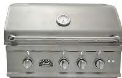
32" Build-in Grill 321BQTRL