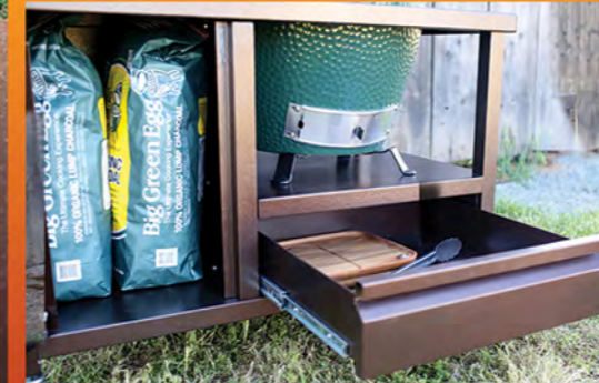
Spacious storage cabinet and drawer holds all the essentials with ease.