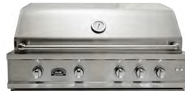
42" Build-in Grill 421BQRL