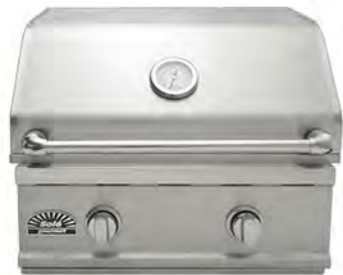
26" Build-in Grill 261BQTR

Solé TR Series Grills feature easy slide-in that is ideal for quick, simple installation for recessed designs or islands with custom trim.