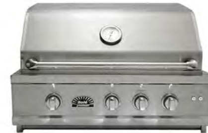
30" Build-in Grill 301BQRRL

Solé Luxury Series Grills feature a flat stainless steel bezel on top and overlapping control panel for a seamless professional look without the need for custom trim.