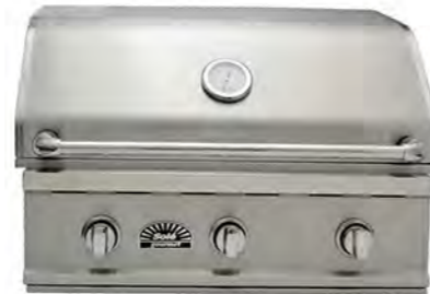
32" Build-in Grill 320BQTR