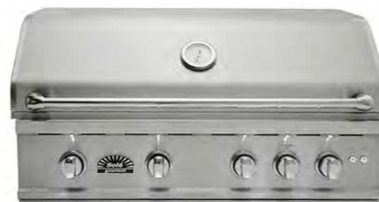
38" Build-in Grill 381BQTRL