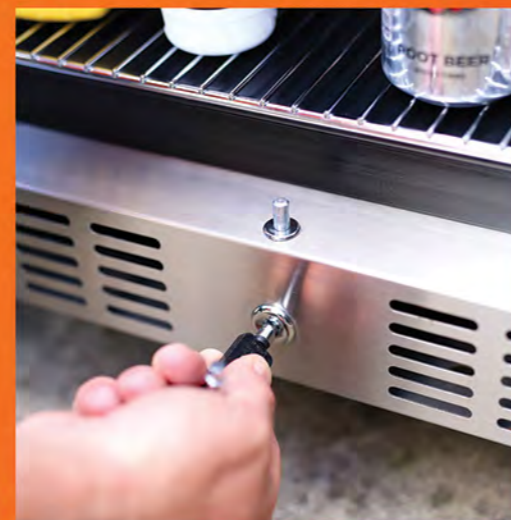
Key lock for securing your items.