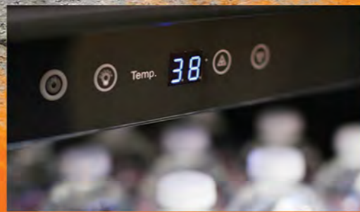
Digital Temperature Display